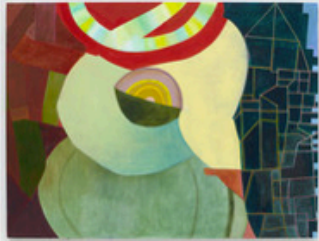
"Untitled (9-26) (The Katy Kill)" (2012) by Thomas Nozkowski.