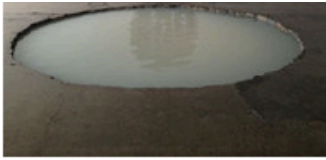
Doug Aitken's "100 YRS" exhibition at 303 Gallery. The show's centerpiece is a sonic fountain.