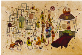
"Pipes" (2013) by Iranian artist Shiva Ahmadi. The artist mixes 16th century Persian painting with images of pipelines and bloody rulers. Source: Leila Heller Gallery via Bloomberg

photographs of the members of African lesbian and transgender communities. All but one image were part of Muholi's project at the Documenta survey of contemporary art in Kassel, Germany , in 2012. Each framed work is $4,200.