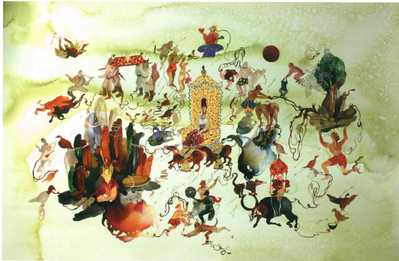
Al-Khidr, 2009 Mixed media on Aquaboard 40 x 60 in (101.6 x 152.4 cm)

above the picture plane. Ahmadi conflates two of these modes: the enthroned prince in a pleasure garden surrounded by his courtly companions, and battle scenes. In her works, the enthroned prince is no longer a cultivated ruler whose legitimacy is recognized and whose pleasant company sought, but a usurper dressed in sumptuous clothes who lacks the moral compass and obligation of princes: generosity, lawful actions, and protection of the defenseless. Instead of pious humility, the grandeur of the usurper increases with the monumentality and menace of his throne. His field of action expands beyond normal proportions, and he insures the loyalty of the creatures that serve him with blood and humiliation. The armies of monkey figures that Ahmadi uses to symbolize the degradation of servants of corrupt masters are drawn from illustrations of the Hindu epic, the Ramayana , though the levels of meaning given to them are unrelated to their original context.