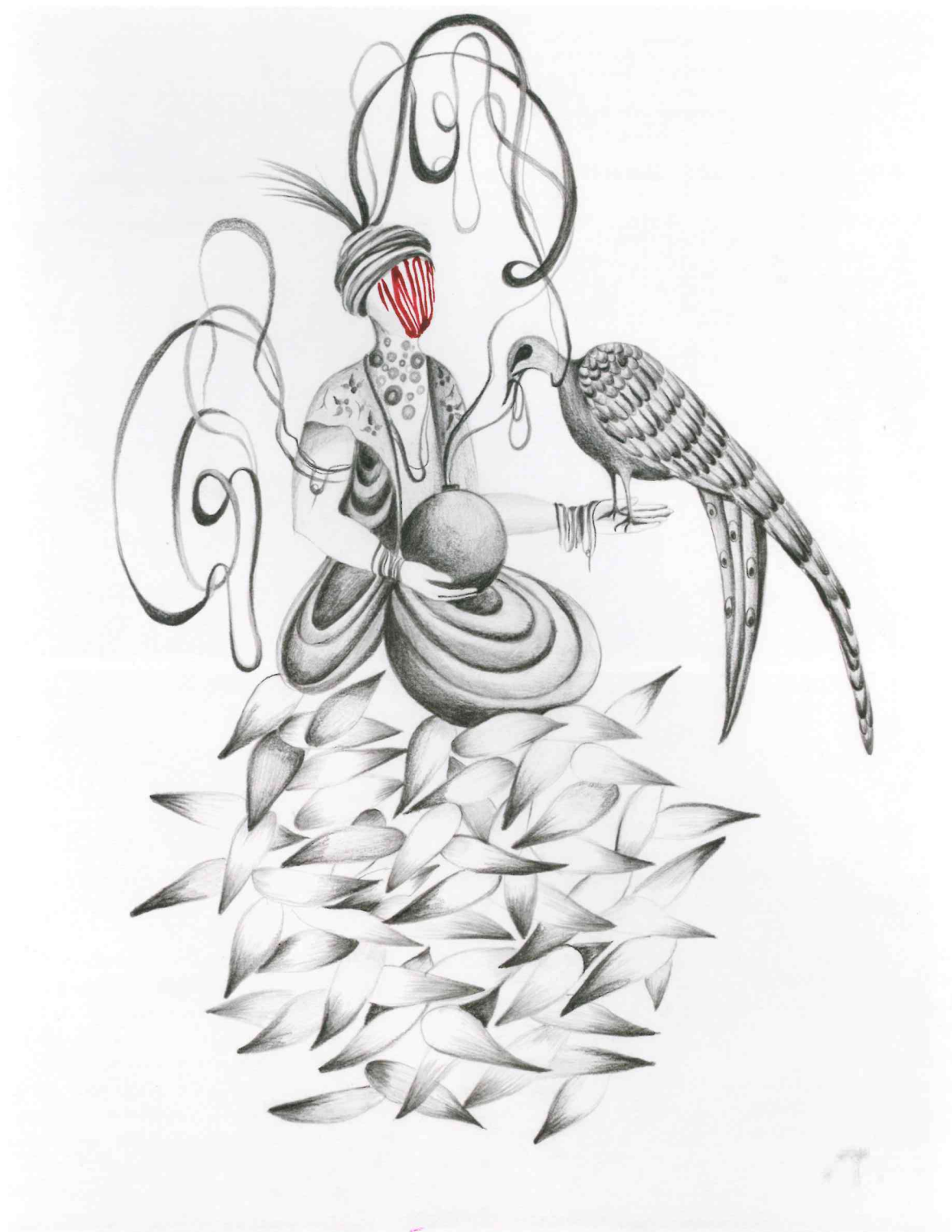
Untitled 3, 2013 Graphite on paper, 14 x 11 in (35.6 x 27.9 cm)

These shared archetypes are concentrated in her most challenging diptych to date, Cube , also the subject of an animation. Here, an enthroned monkey with followers standing in a prayer posture face toward a Ka'aba with monkey pilgrims. The monkey figures wear white caps, and there is no doubt that Ahmadi's critique is directed toward the corruption of religion for the sake of power. Linking the two scenes are industrial pipes, silos, and