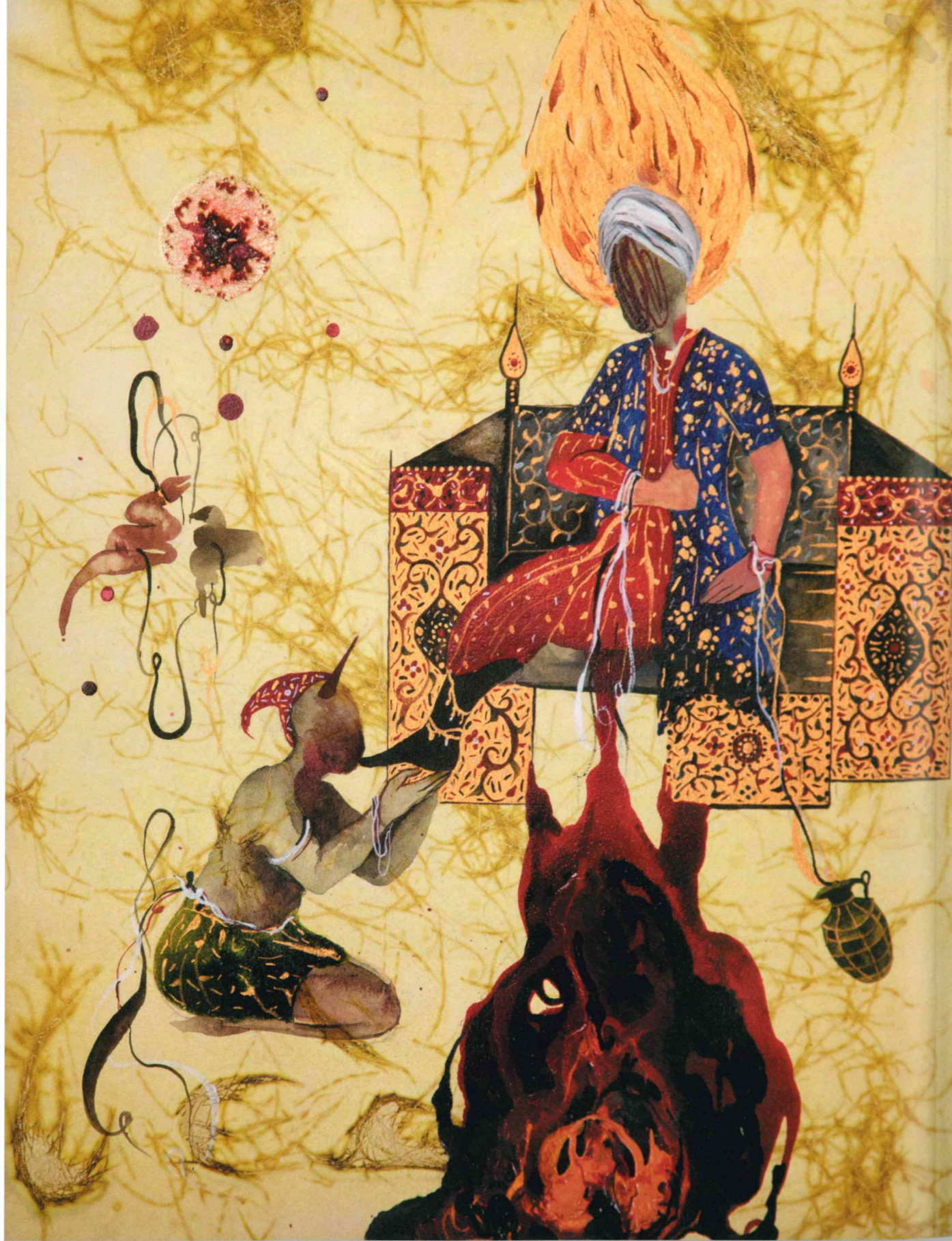
Untitled 2 (from Throne) , 2012 Mixed media on Aquaboard 14 x 11 in (35.6 x 27.9 cm)

In Iranian book-painting of the fifteenth and sixteenth centuries, scenes with multiple figures, particularly outdoor scenes, were painted from the perspective of a high angle. The viewer looks down at the action of the story, and takes in multiple narratives from a position