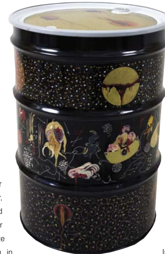
Facing page: Charles Hossein Zenderoudi. (Detail) Untitled. 1972. Oil on canvas. 120.6 x 90.2 cm. © Charles Hossein Zenderoudi, Courtesy Leila Taghinia-Milani Heller (LTMH) Gallery, NY. Above: Shiva Ahmadi. Oil Barrel #4. 2009. Oil on steel. 87.6 x 59.7 x 59.7 cm. © Shiva Ahmadi, Courtesy Leila Taghinia-Milani Heller (LTMH) Gallery, NY.

In the past few years, the emerging Contemporary Middle Eastern art market has experienced a boom, with an influx of galleries across the region and the establishment of auction houses in Dubai,