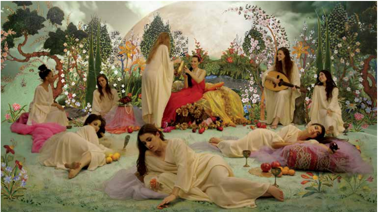
FROM TOP: Toil and The Banquet of Houries , two stills from The King of Black , 2013. HD video with sound, 24 min.