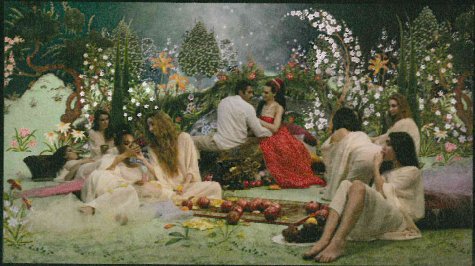
Shoja Azari The King of Black , 2013 (oil on silk) HD color video with sound