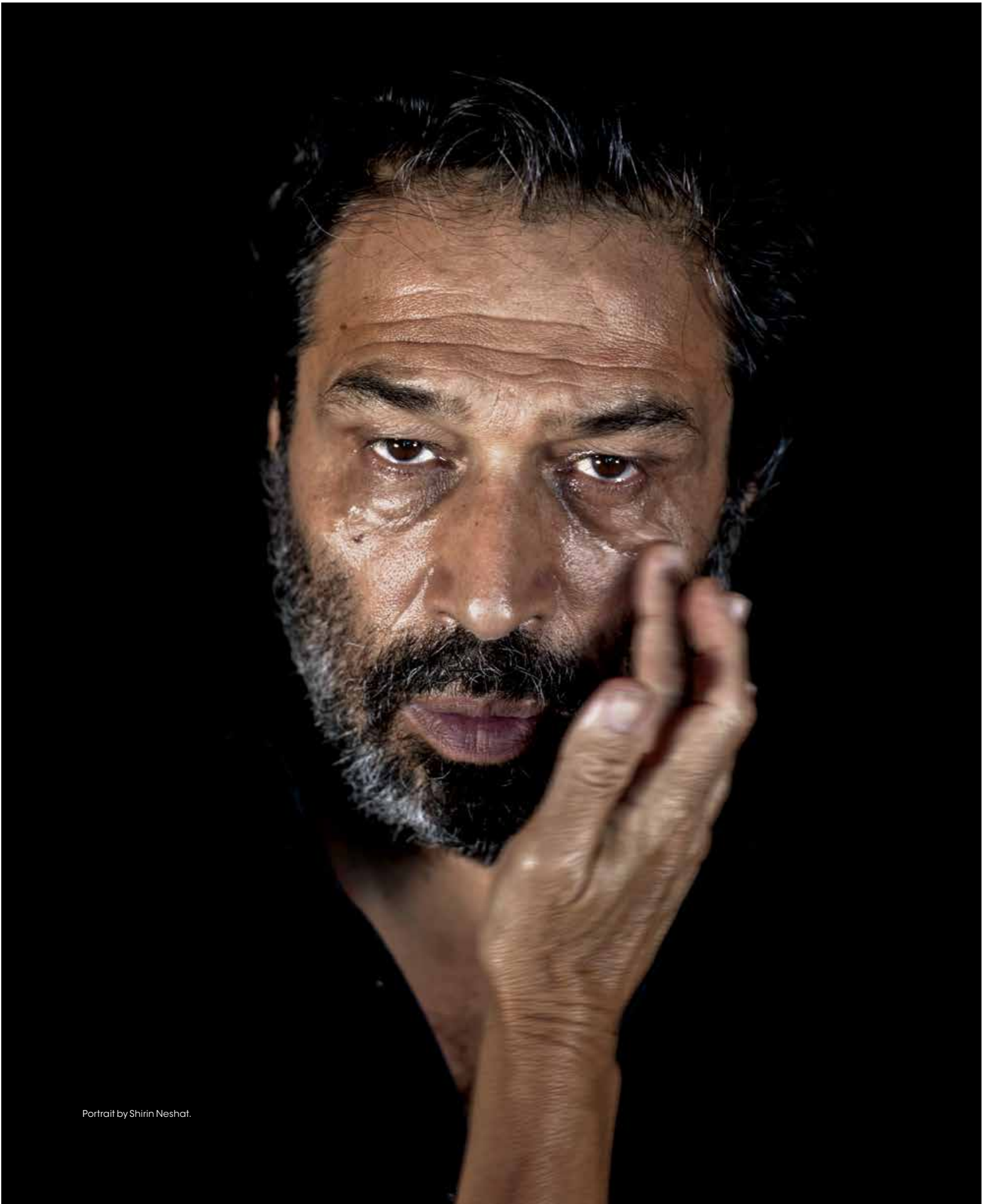
Portrait by Shirin Neshat.