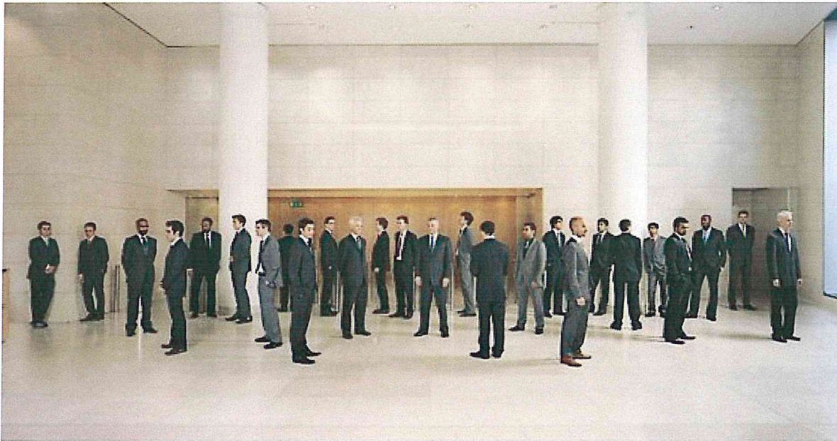
Mitra Tabrizian - City, London 2008 Type C photograph on paper Edition of 5 48 x 98.5 in / 122 x 250 cm