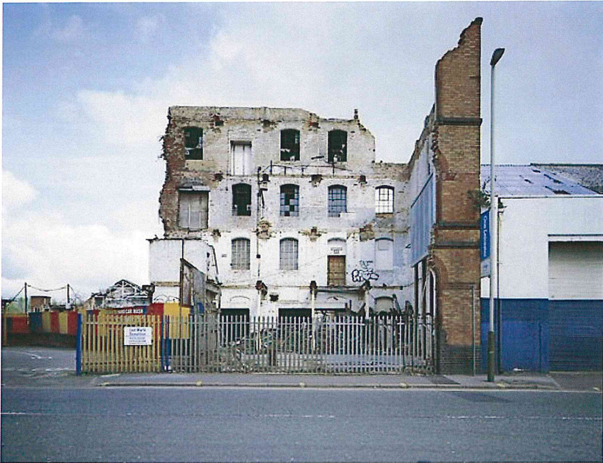
Mitra Tabrizian - Leicestershire 2012, 2012 C-type photographic print 62 x 48 in / 158.5 x 122 cm Edition of 5, 2 APs