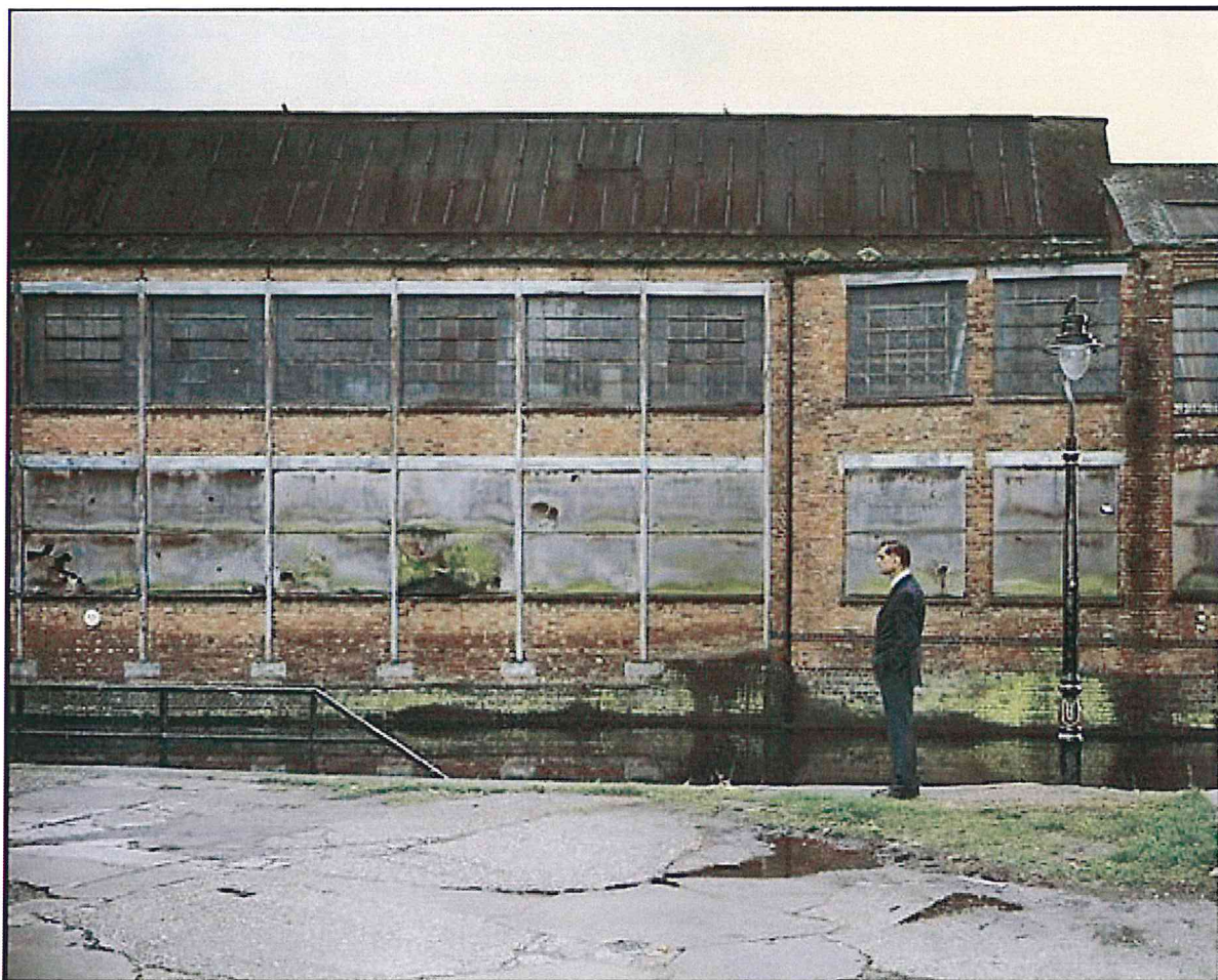
Mitra Tabrizian - Leicestershire 2012, 2012 C-type photographic print 61 x 48 / 156 x 122 cm Edition of 5, 2 APs