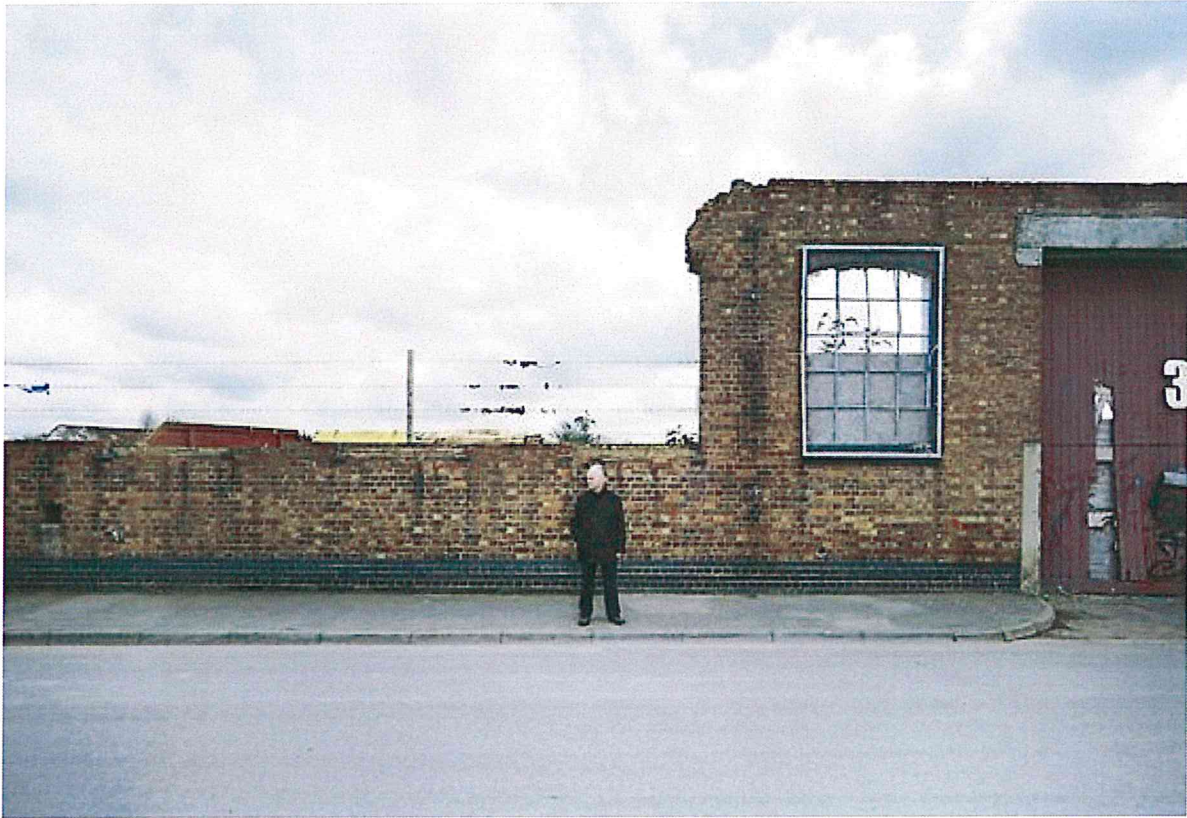
Mitra Tabrizian - Leicestershire 2012, 2012 C-type photographic print 71 x 48 in / 181.5 x 122 cm Edition of 5, 2 APs