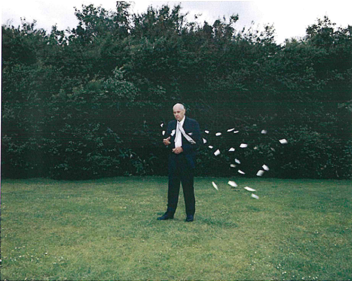
Mitra Tabrizian - Lost Time Series 2002 Type C photograph on paper Edition of 5 48 x 60 in / 122 x 152 cm

A photograph taken at JP Morgan bank's lobby during the height of the financial crises, depicts the bank's associates with a sense of disconnection staring into the middle distance, each an island to themselves. Tabrizian has used actors in staged settings for her past works, but in this case she has used the actual bank's employees to reflect the corporate culture which she reconstructs in her own view as a 'cold and flat' mise-en-scène.