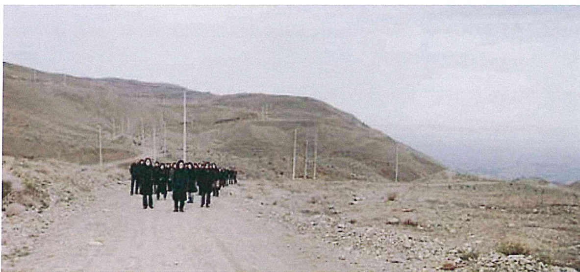
Mitra Tabrizian - Untitled 2009 (Printed 2010) Type C photograph on paper Edition of 5 50 x 116.5 in / 127 x 296 cm