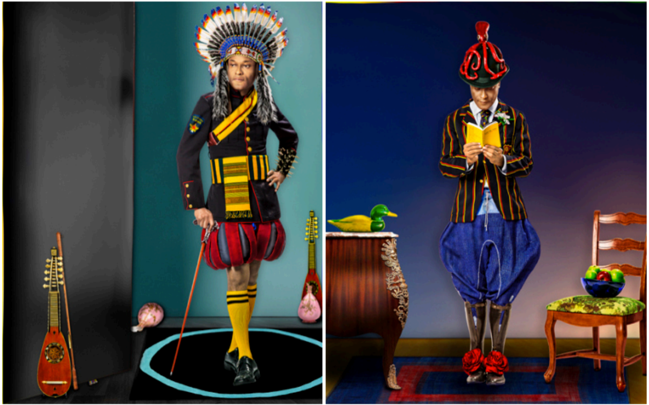
Iké Udé on show at Leila Heller Gallery from October 10 to November 10