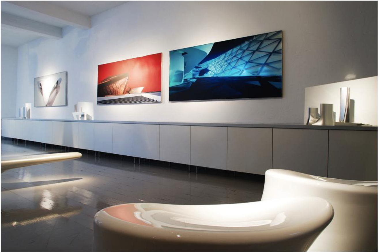
A 2007 Hadid show at Cologne's Ammann Gallery included three of the architect's "silver paintings" — digital renderings of buildings made shiny and metallic by coatings of chrome, gelatin and other finishes — and pieces from her Eolia seating series, 2006. The silver paintings on the back wall are, from left, The Médiathèque in Pau , 2003; Guangzhou Opera House – exterior , 2006; and Guangzhou Opera House – interior , 2006.

To Hadid's compatriots in the art and design realms, she was approachable, dependable and kind. And busy — not just with architecture, of course, but with objects ranging from silverware and sofas to cars and boats to shoes and jewelry.