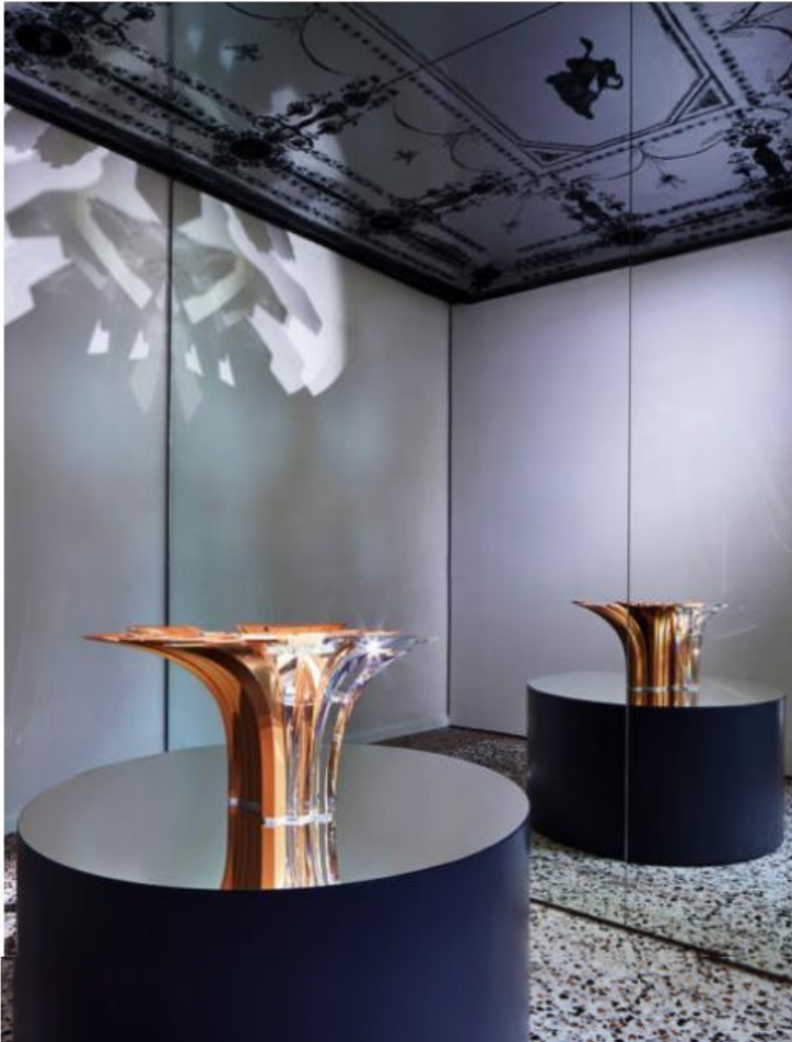
The architect's new crystal and metal columnar centerpieces for Swarovski were unveiled posthumously during Milan design week last month.