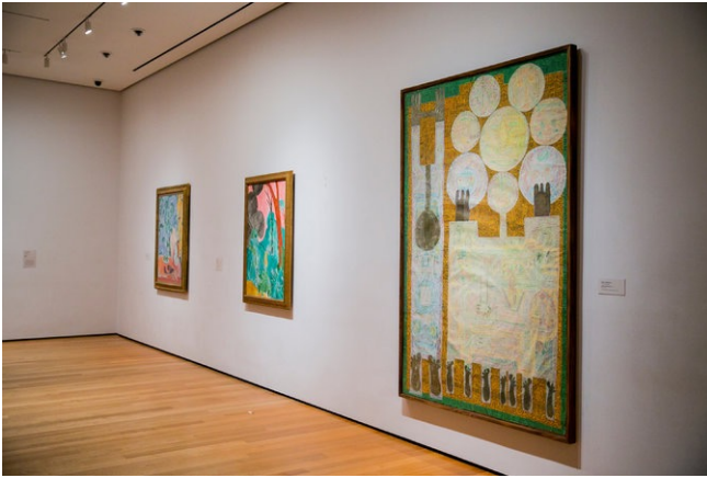
“K+L+32+H+4. Mon père et moi (My Father and I)” right, by Charles Hossein Zenderoudi, on display at the Museum of Modern Art in New York.

Seven works by artists such as the Sudanese painter Ibrahim el-Salahi , the Iraqi-born architect Zaha Hadid , and the Los Angeles-based Iranian video artist Tala Madani , were installed Thursday night in MoMA’s fifth-floor galleries, replacing seven works by Picasso, Matisse and Picabia, among other Western artists. Alongside each work is a wall text that plainly states the museum’s intentions: “This work is by an artist from a nation whose citizens are being denied entry into the United States, according to a presidential executive order issued on Jan. 27, 2017. This is one of several such artworks from the Museum’s collection installed throughout the fifth-floor galleries to affirm the ideals of welcome and freedom as vital to this Museum as they are to the United States.”