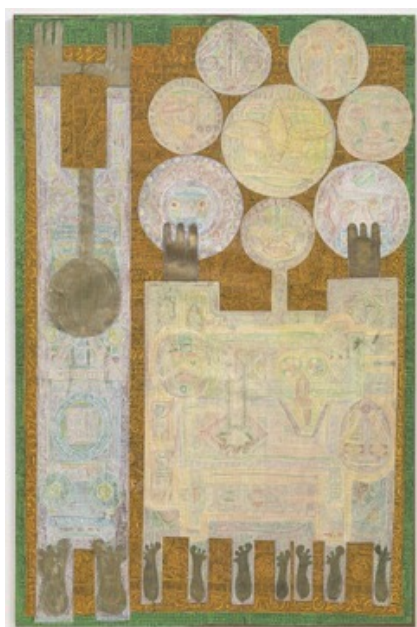
Charles Hossein Zenderoudi, K+L+32+H+4. Mon père et moi (My Father and I) (1962)