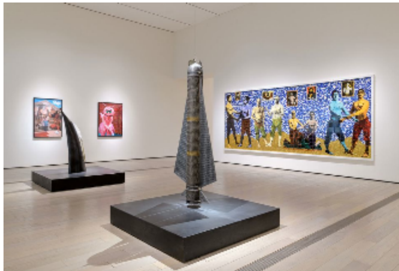
Installation view of In the Fields of Empty Days , opening this weekend

Artists based in Iran were absent at the opening of exhibition of historical and contemporary Iranian art this week due to Trump's travel ban