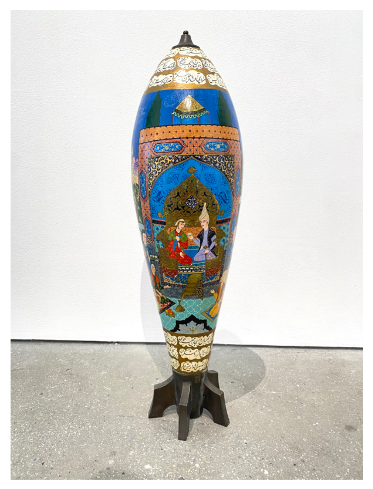
Iran, 2016, Hand painted wood, Brass base and top, Edition 5/6, 73 \times 21 \times 21 cm

WAS lokes to personalist control and spooride social media features and to analyse our traffic. We also share information about your use of our site with our social media, advertising and analytics partners who may combine it with other information that you've provided to them or that they've collected from your use of their services