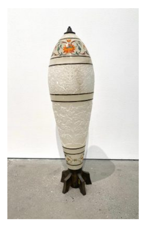
India, 2016, Hand carved alabaster, stone, Brass base and top, Edition 6/6, 76 \times 21 \times 21 \text{ cm}