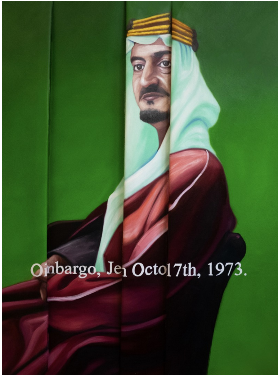
Sultan bin Fahad's "Oinbargo," 2025. Oil on folded canvas. (Courtesy of the artist and Leila Heller)

Saudi multidisciplinary artist Sultan bin Fahad is presenting his latest canvas works in “ Cncve ,” his solo exhibition at Leila Heller Gallery in New York . Exploring questions of power and its cyclical path through history, Fahad creates what appear to be folded portraits of former world leaders . One such work references Faisal bin Abdulaziz Al Saud , featuring nearly illegible text like “oinbargo, October 1973,” alluding to the 1973 oil embargo orchestrated by the Organization of Arab Petroleum Exporting