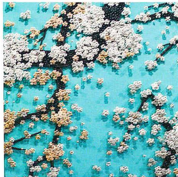
Leila Heller Gallery www.leilahellergallery.com

Bernar Venet , Two Indeterminate Lines , 2012, Rolled Steel, 200 x 235 x 240 cm, 78.7 x 92.5 x 94.5 inches