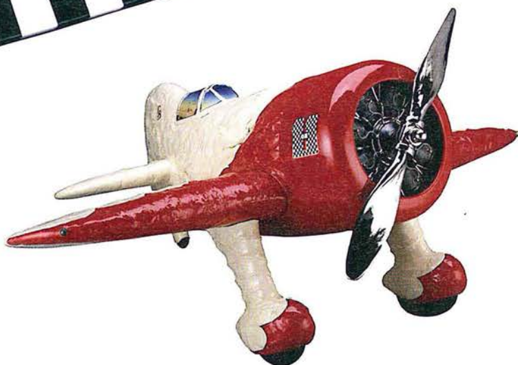
Allan Stone Gallery www.allanstonegallery.com

Lynn Chadwick , Reclining Figures on Stripes , 1974, Cast bronze, Marble, Stamped signature and date to each figure '685 1/8, Chadwick 74', Numbered: 1/8, 12 1/4 W x 16 1/2 D x 5 3/4 H inches