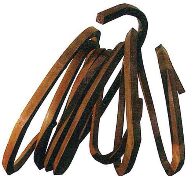
Galerie Forsblom www.galerieforsblom.com