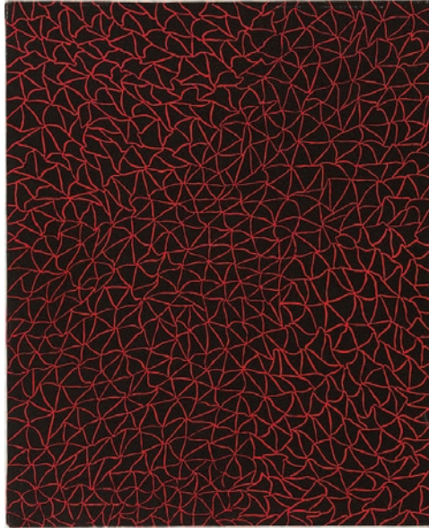
Yayoi Kusama Infinity Nets (A.B.), 1979 Acrylic on canvas 25.7 x 20.9 in / 65.3 x 53.1 cm

Leila Heller Gallery is pleased to announce its participation in Masterpiece London, June 26 – July 3, 2013, at the South Grounds of The Royal Hospital Chelsea, booth D18. In the main space, the gallery will exhibit a presentation of established contemporary masters paired with gallery artists. On view in a separate viewing room, will be works by modern masters. Additionally, Leila Heller Gallery will present a neon installation by Berlin based artist Leila Pazooki in the fair's public space.