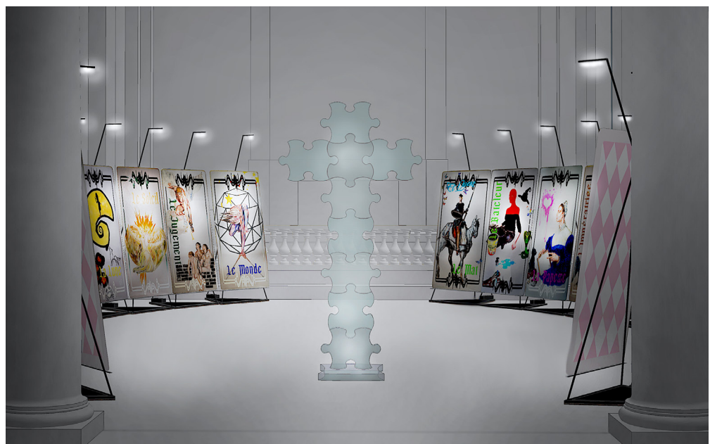
The Soothsayer Exhibition view, 3D simulation

With The Soothsayer, Mouna Rebeiz has succeeded at leaving her easel behind and dared to gamble on the immersive installation. Sensitive, cognitive, and experimental.