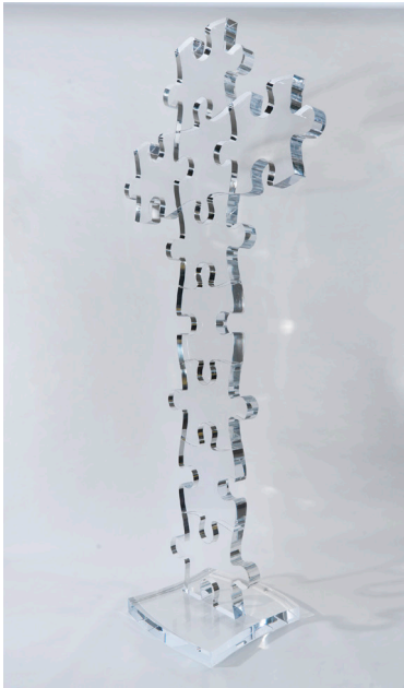
Seiya T, 2022 Puzzle pieces made from recycled plexi 240 x 50 x 6 cm

Above the illuminated cards, a prophecy which will later be found on paper or sent by email is projected on the walls of the church. “A link between sacred and profane”, was Rebeiz’s idea. “The works will remain in place during services in this very religious atmosphere.” An actual tarot deck on paper might stem from Rebeiz’s delicate paintings on polished aluminium.