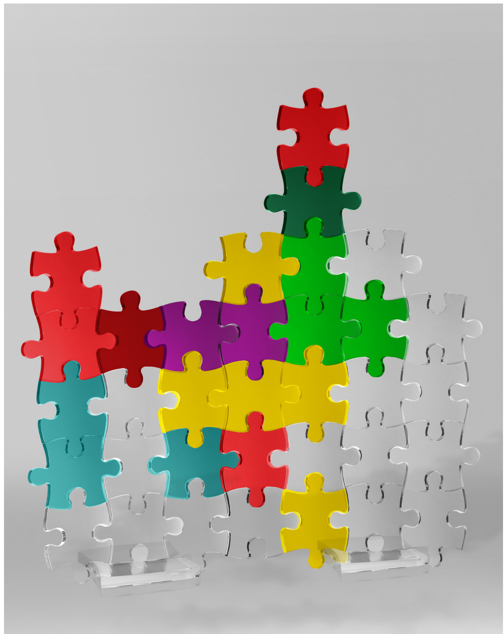
The Wall, 2022 Interactive puzzle wall made from recycled plexi 260cm x 248cm x 21cm

The setup serves as a metaphor for our contemporary society in which man is all-powerful, to use the words of Protagoras, the measure of all things, and in which all mystery or mysticism is annihilated by the power of technology. But is identity reducible to an algorithm? Is the future predictable by a machine? Have we exhausted all the mysteries that embrace life and humanity? Has the World said its last word?