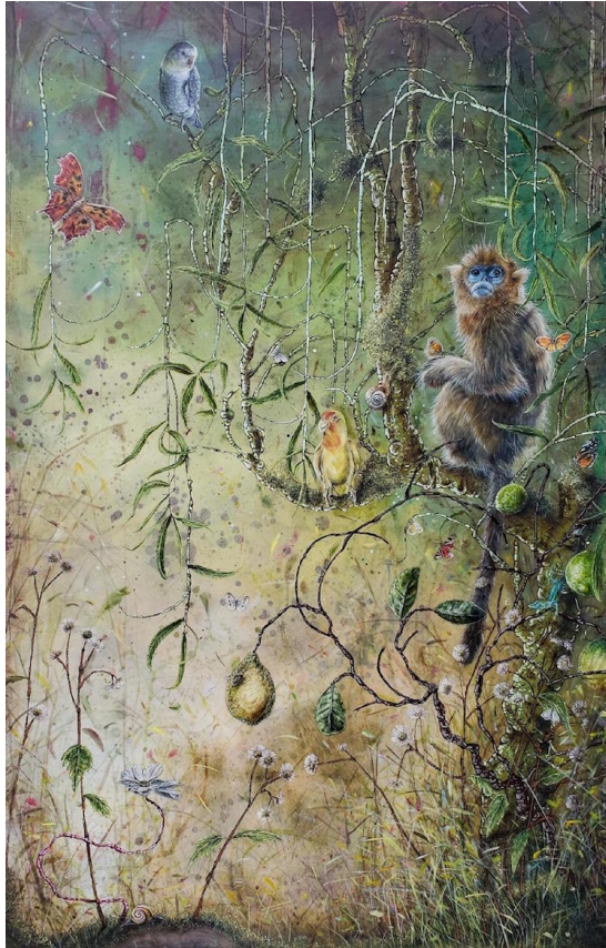
"under the willows"