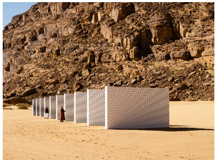
— Claudia Comte, Dark Suns, Bright Waves , installation view, Desert X AIUla 2022, courtesy the artist and Desert X AIUla, photo by Lance Gerber