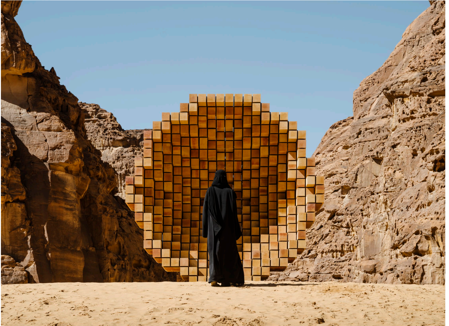
— Dana Awartani, Where The Dwellers Lay , installation view, Desert X AIUla 2022