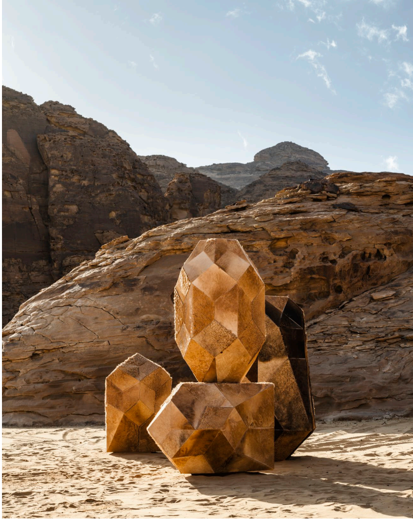
— Zeinab Alhashemi, Camouflage 2.0 , installation view, Desert X AlUla 2022, courtesy the artist and Desert X AlUla, photo by Lance Gerber