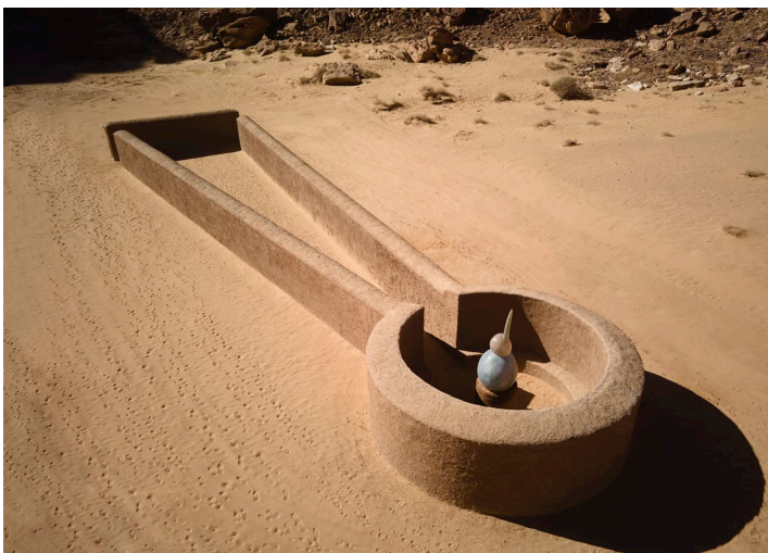
— Sultan bin Fahad, Desert Kite , installation view, Desert X AIUla 2022, courtesy the artist and Desert X AIUla, photo by Lance Gerber