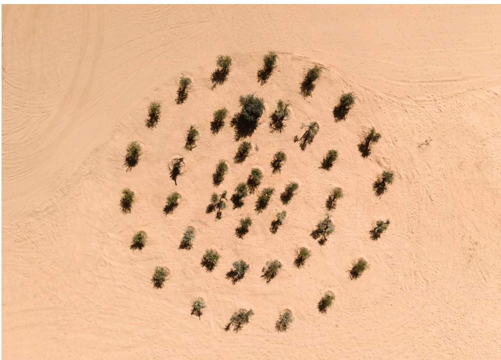
— Khalil Rabah, Grounding , installation view, Desert X AlUla 2022