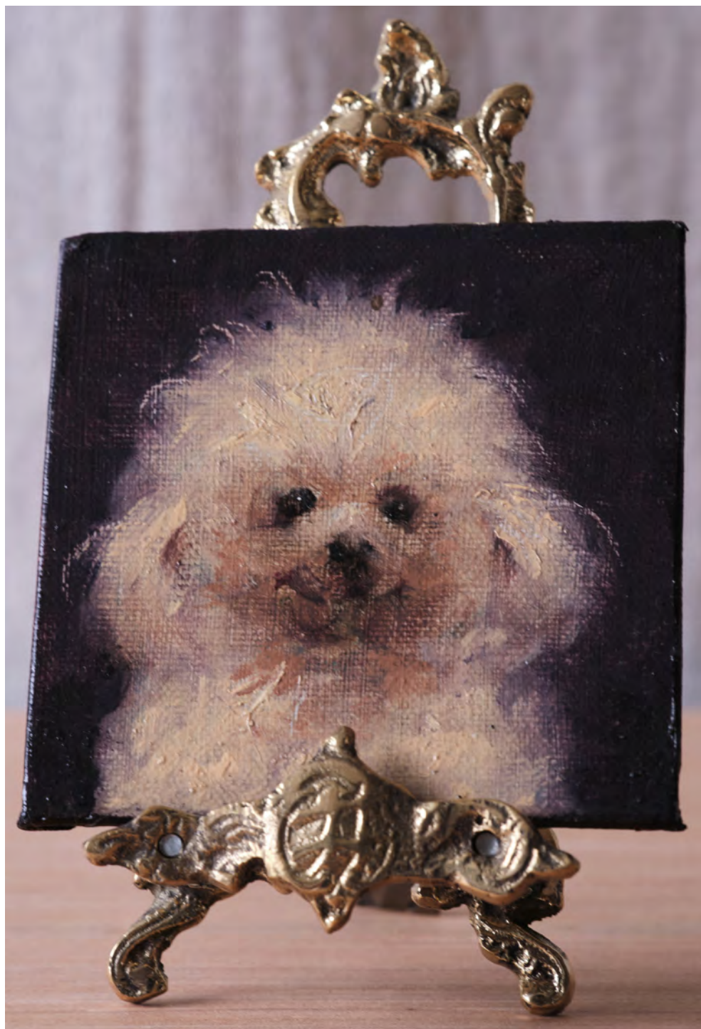
Lufy , 2025 Oil on Board 10h x 10w x 0.2d cm / 3.9h x 3.9w x 0.1d in.