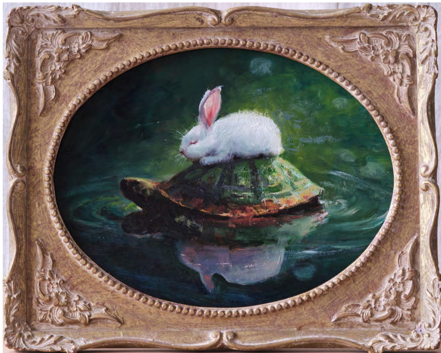
Downtime, 2025 Oil on Linen 31h x 39w x 2.5d cm / 12.2h x 15.4w x 1d in.