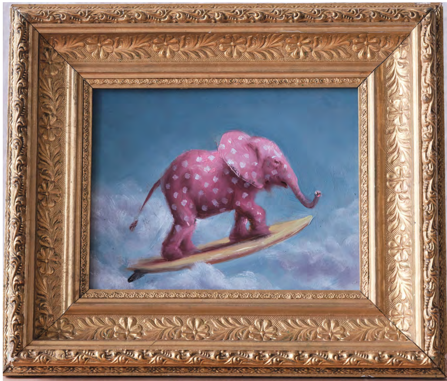
Cloud Surfer , 2025 Oil on Board 29.1h x 34.5w x 4.5d cm / 11.5h x 13.6w x 1.8d in.