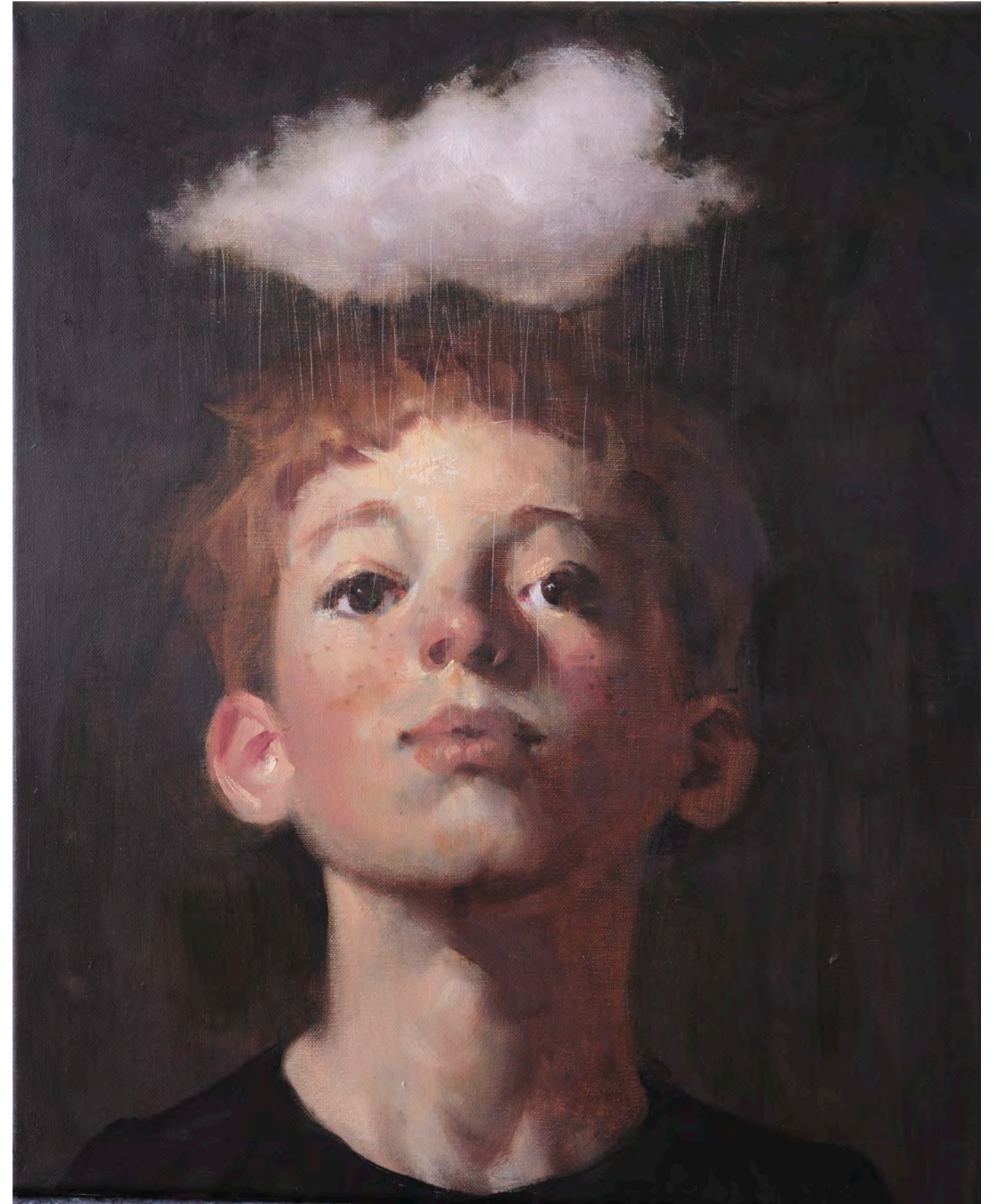
Boy and The Cloud, 2025 Oil on Linen 50h x 40w x 2d cm / 19.7h x 15.7w x 0.8d in.