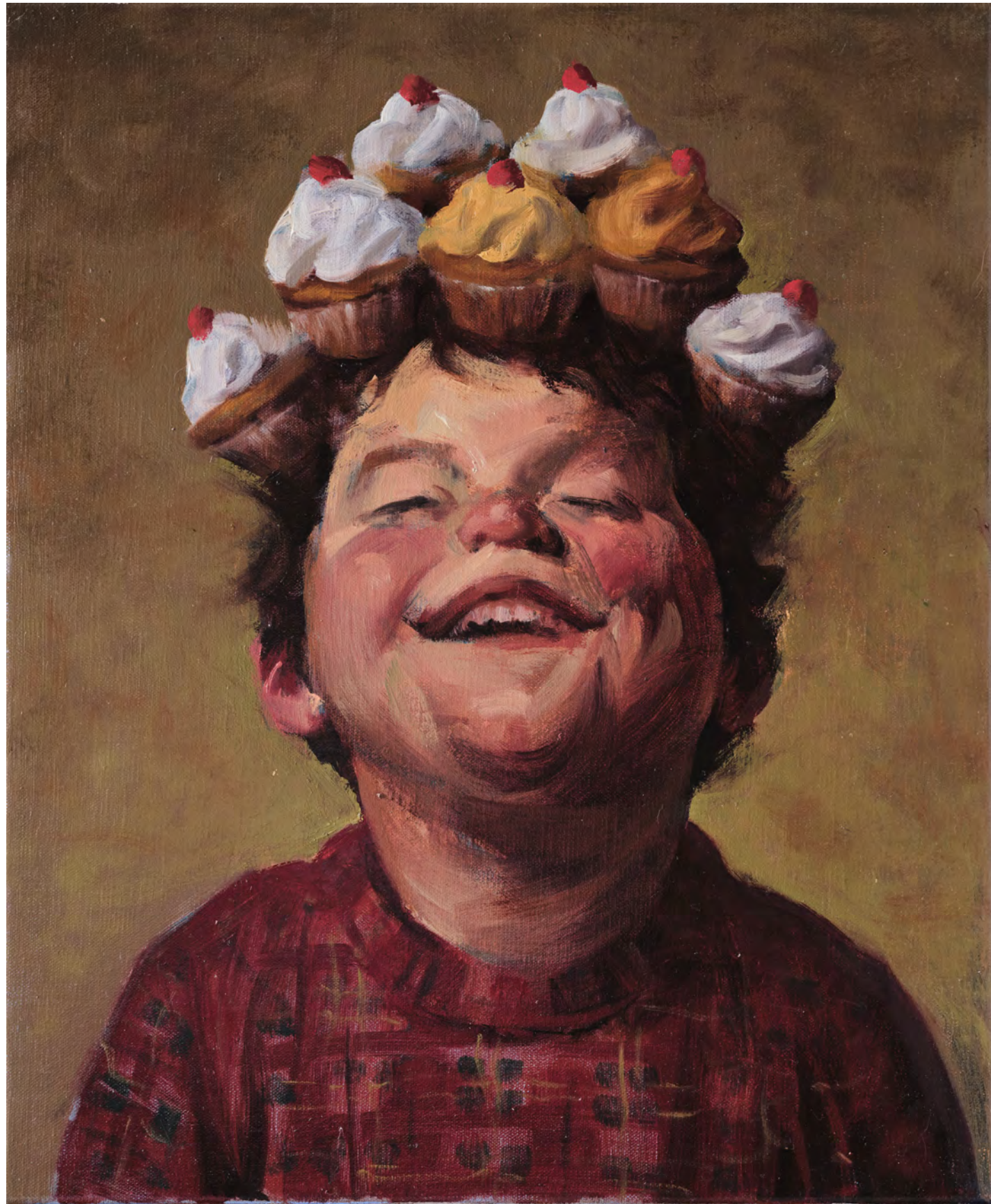
Birthday Boy, 2025 Oil on Linen 50h x 40w x 2d cm / 19.7h x 15.7w x 0.8d in.