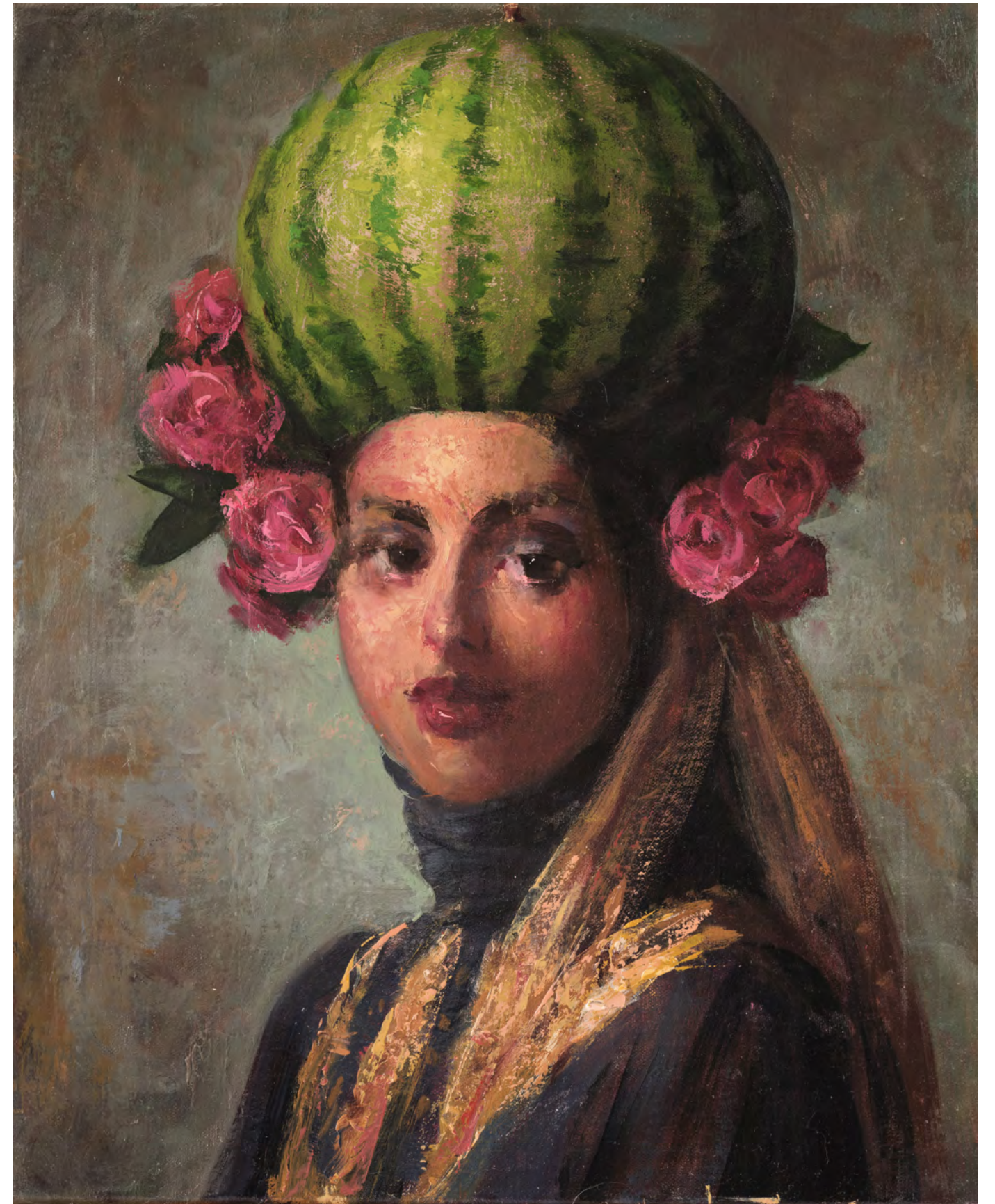
Princess of Palestine, 2025 Oil on Linen 50h x 40w x 2d cm / 19.7h x 15.7w x 0.8d in.