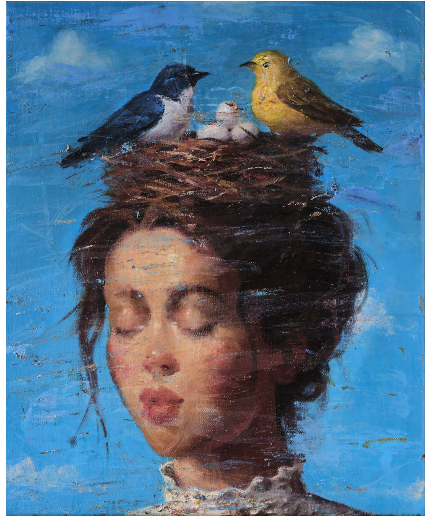
Fresh Air, 2025 Oil on Linen 50h x 40w x 2d cm / 19.7h x 15.7w x 0.8d in.