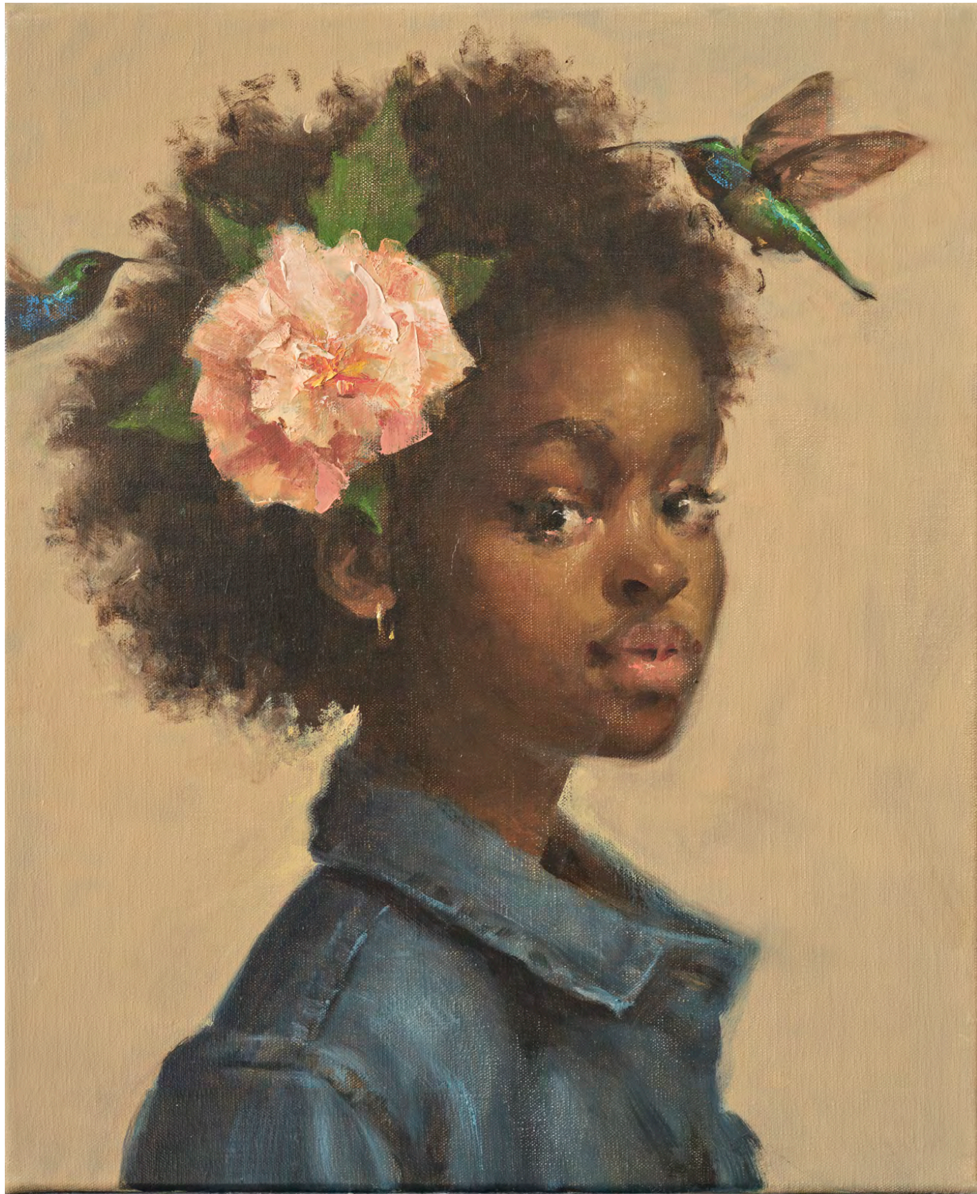
April, 2025 Oil on Linen 50h x 40w x 2d cm / 19.7h x 15.7w x 0.8d in.