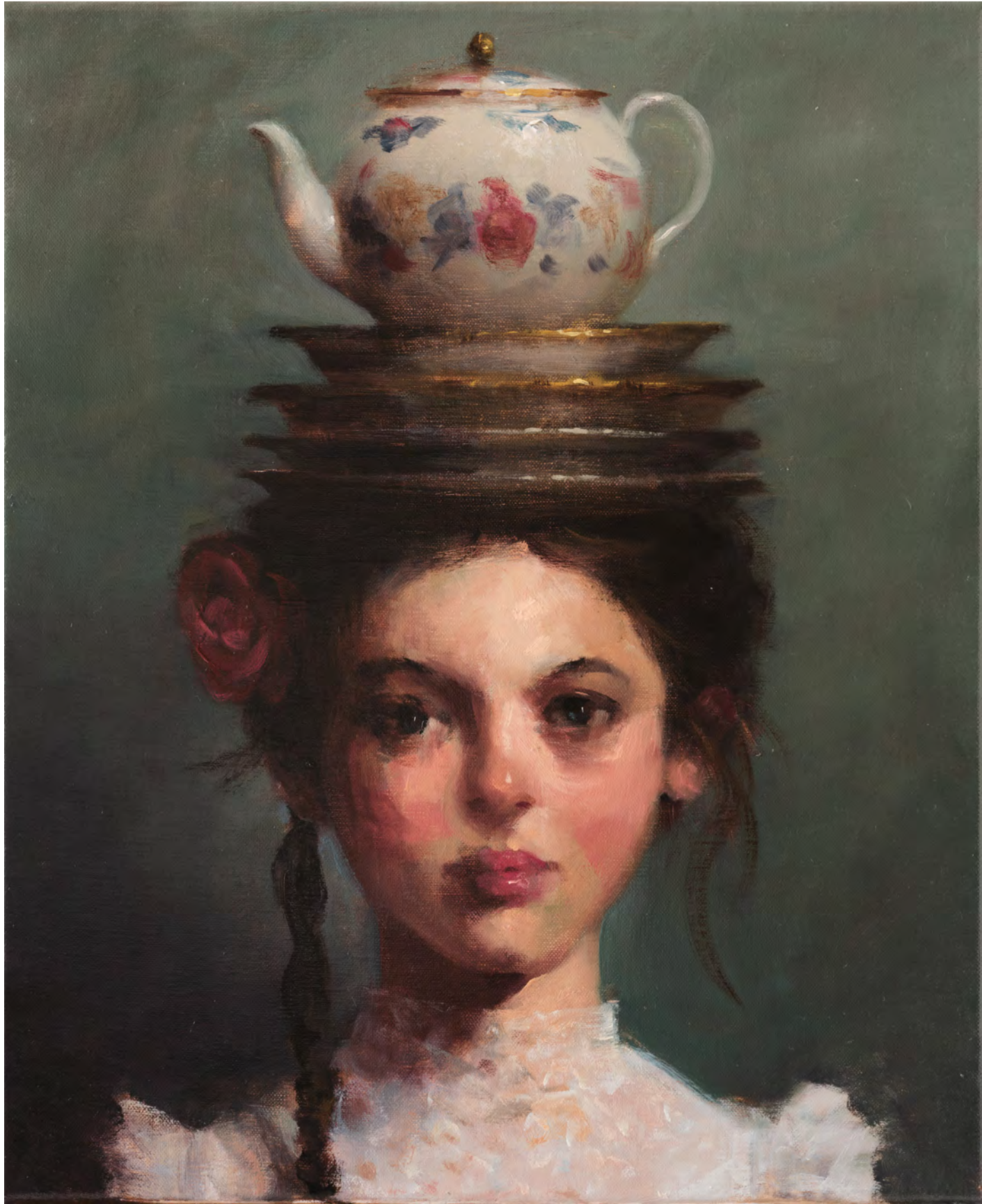
High Tea, 2025 Oil on Linen 50h x 40w x 2d cm / 19.7h x 15.7w x 0.8d in.