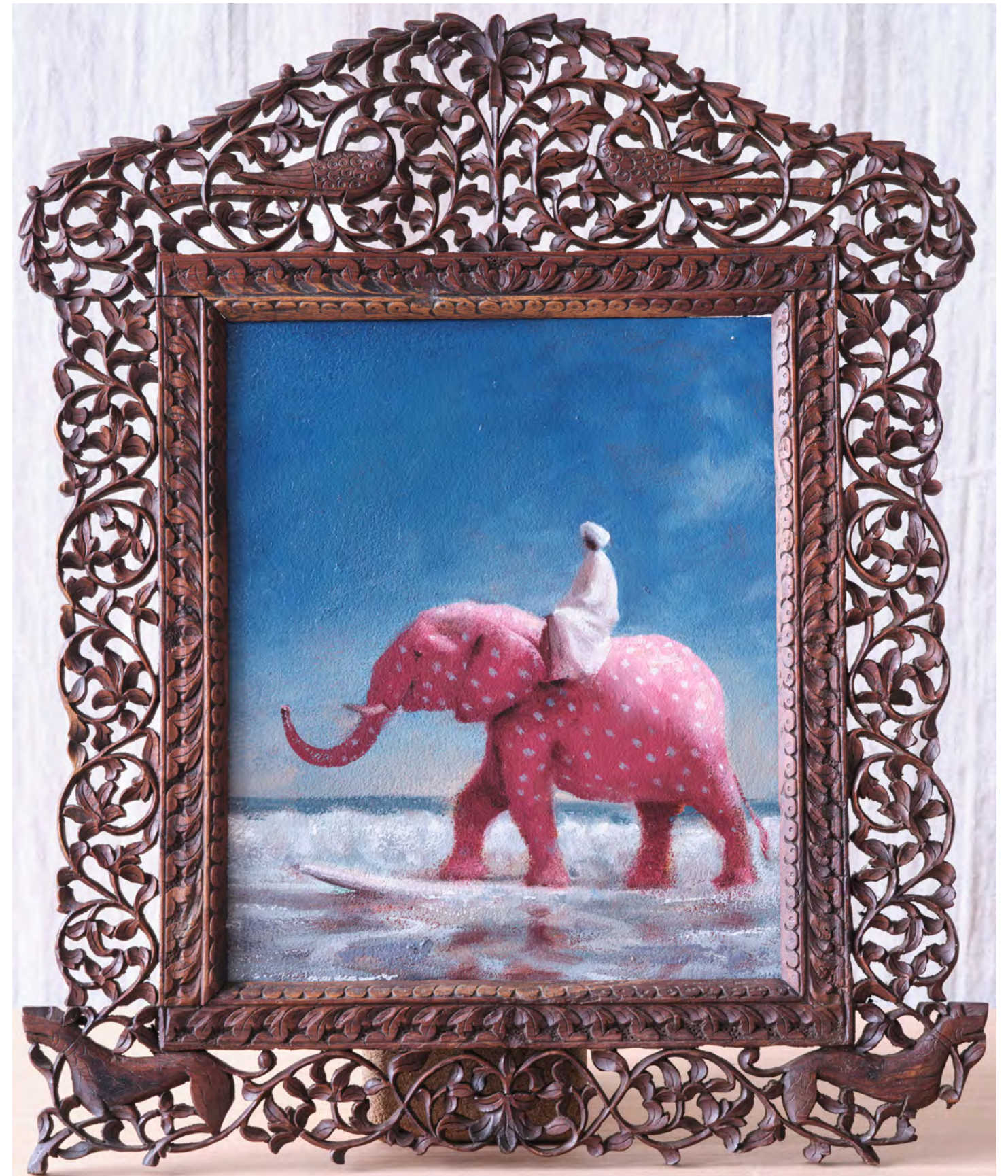
Senegal Glide , 2025 Oil on Board 50.7h x 43w x 1.8d cm / 20h x 16.9w x 0.7d in.