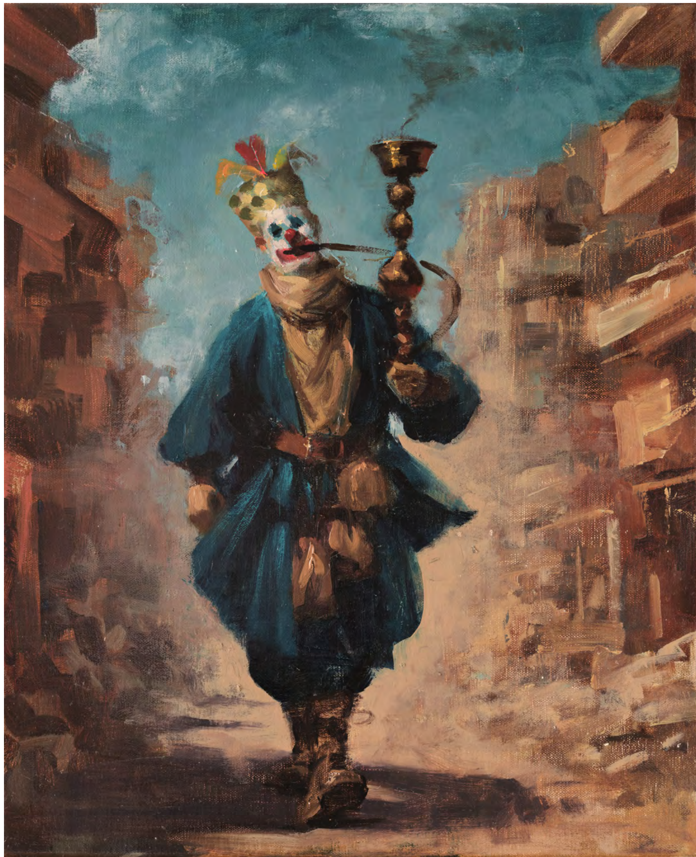
Gaza Circus School, 2025 Oil on Linen 50h x 40w x 2d cm / 19.7h x 15.7w x 0.8d in.