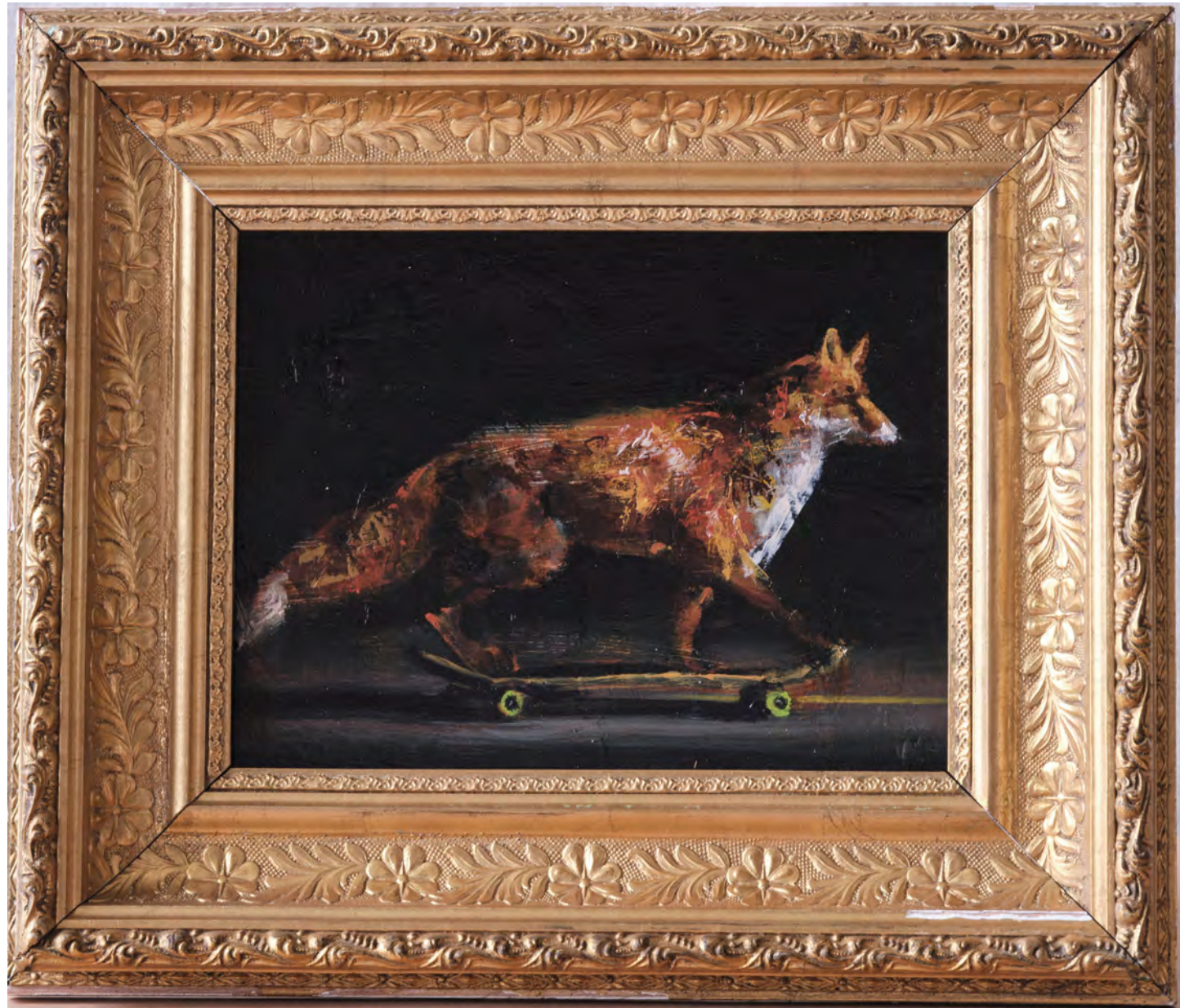
Tailspin , 2025 Oil on Board 30h x 35w x 5d cm / 11.8h x 13.8w x 2d in.