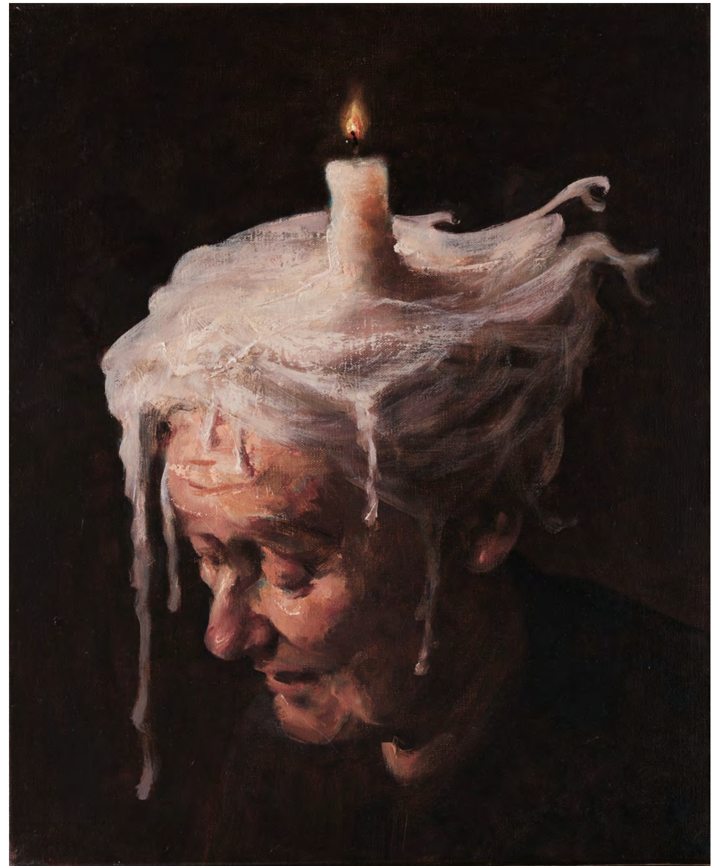
Mother Time, 2025 Oil on Linen 50h x 40w x 2d cm / 19.7h x 15.7w x 0.8d in.