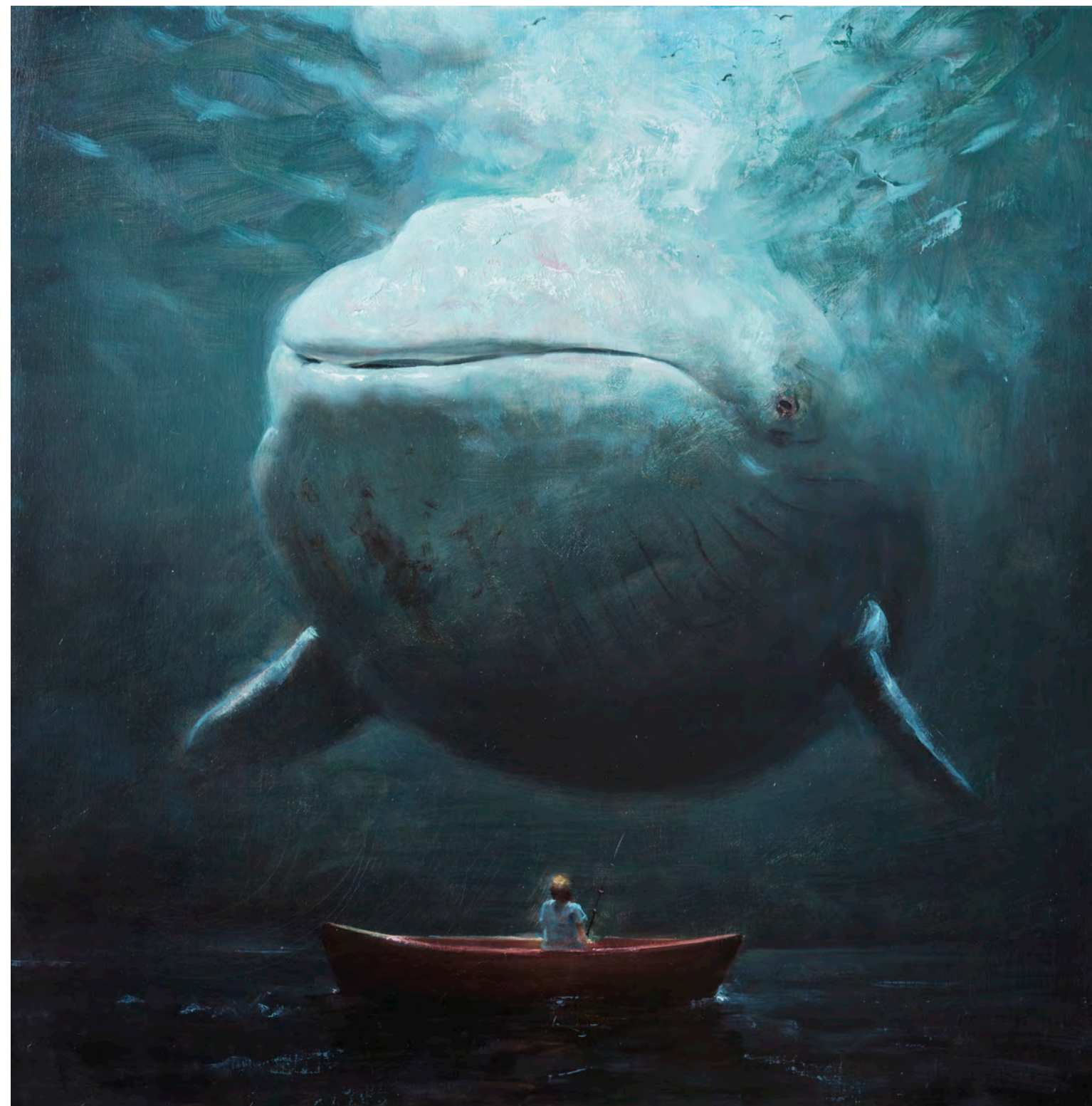
Dream Big, 2025 Oil on Linen 70h x 70w x 2d cm / 27.6h x 27.6w x 0.8d in.