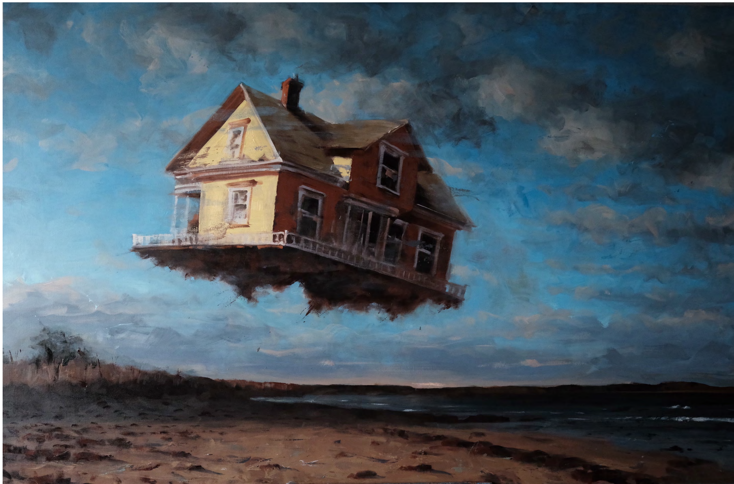
Cape Cod, 2025 Oil on Linen 163h x 260w x 3.2d cm / 64h x 102.4w x 1.3d in.