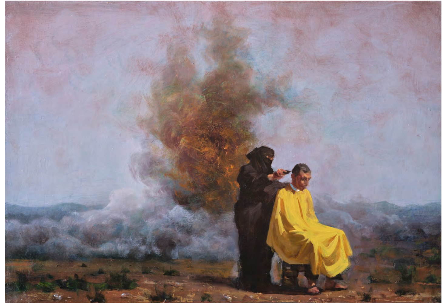
The Gaza Fade , 2025 Oil on Linen 50h x 70w x 2d cm / 19.7h x 27.6w x 0.8d in.

Nick Falco is the son of a boiler mechanic and welder from the South Bronx with exquisite passion and taste.