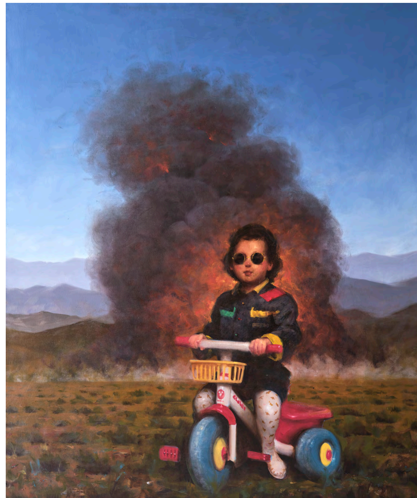
Frontline, 2025 Oil on Linen 182.5h x 152.5w cm / 72h x 60w in.