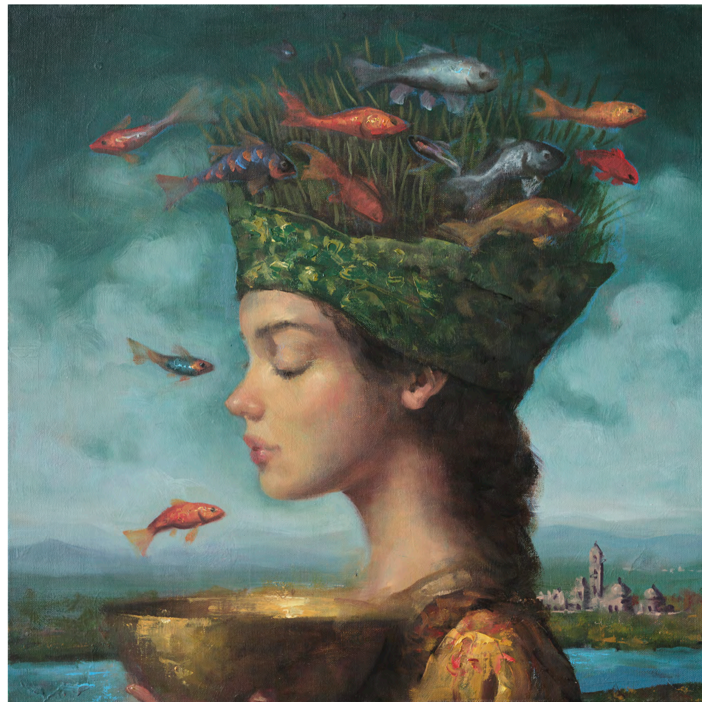
The Alchemist (Noruz) , 2025 Oil on Linen 50h x 50w x 2d cm / 19.7h x 19.7w x 0.8d in.