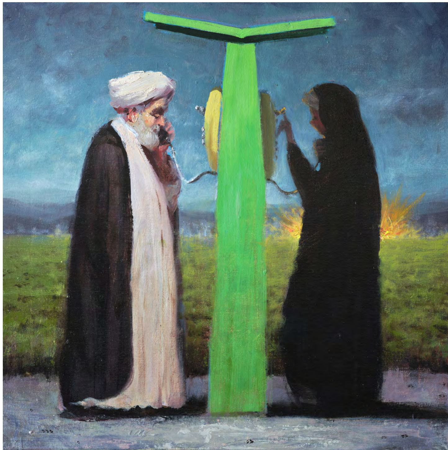
Final Call, 2025 Oil on Linen 50h x 50w x 2d cm / 19.7h x 19.7w x 0.8d in.