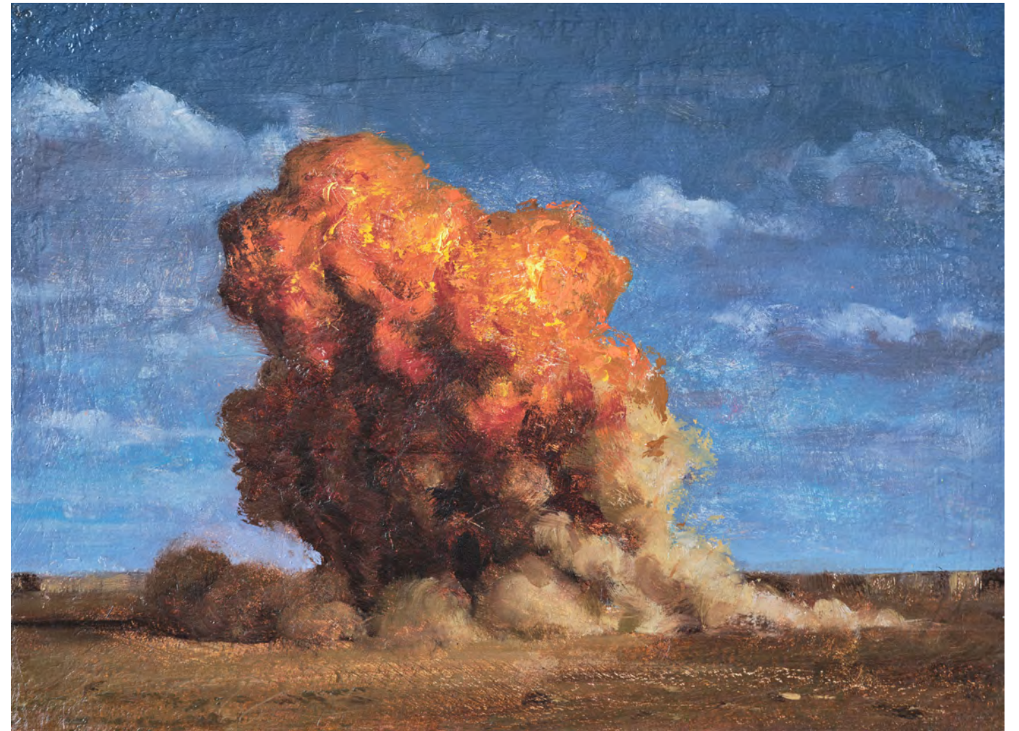
Explosion Study I , 2025 Oil on Board (with gold easel) Painting: 30.6h x 40.5w x 3.6d cm / 12h x 16w x 1.5d in. Easel: 19 x 36 x 18 cm / 7.5 x 14.2 x 7 in.